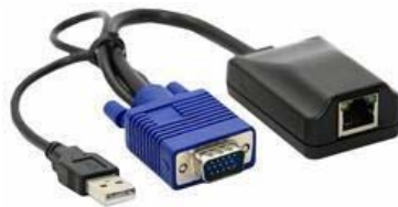
8 pieces USB KVM Dongle